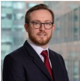
PATRICK MOORE PARTNER • LONDON