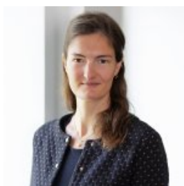
H           COUNSEL • PARIS