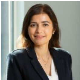
RIPPAN VIG BUSINESS FUNCTIONS • LONDON